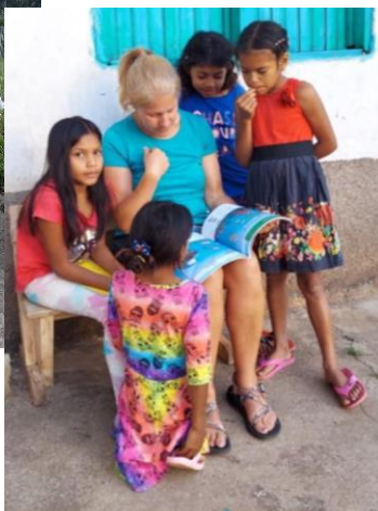
Jen reading to girls

Entertaining the children...creating memories of a lifetime!