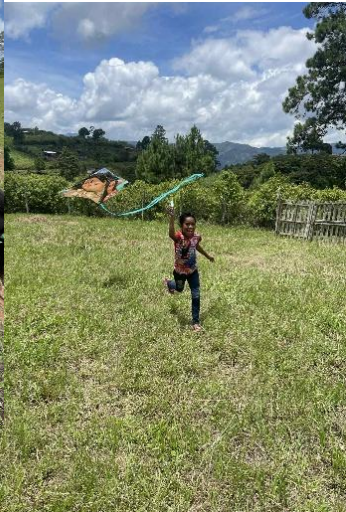
Boy flying a kite