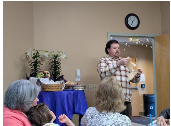
Arcade UCC held an Agape feast on Maundy Thursday.